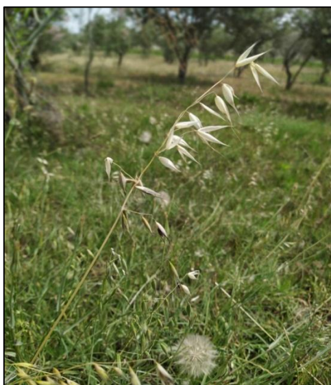
Fig. 7. A. sativa - Grass o. (Hajigabul district, Navai village, 18.05.2022)

Several populations from Azerbaijan were discovered during the expedition: Yardimli distr., the upper part of Pirembel vill., Canak area, N38°55'03", E048°07'02", H1400 m; Hajigabul distr., Navai vill., roadside, N40°02'01", E49°05'13", H45m; Gabala distr., right bank of Demiraparan river, stony and sandy places, N40°58'37", E47°52'14", H972 m.; Masalli distr., Sharafa vill., roadside, N39°04'32", E48°41'25" H -15 m.; Jabrayil distr., Chocuq Marcanli, the edge of the sowing area, N39°23'35", E47°18'18", H151m. (Fig. 7).