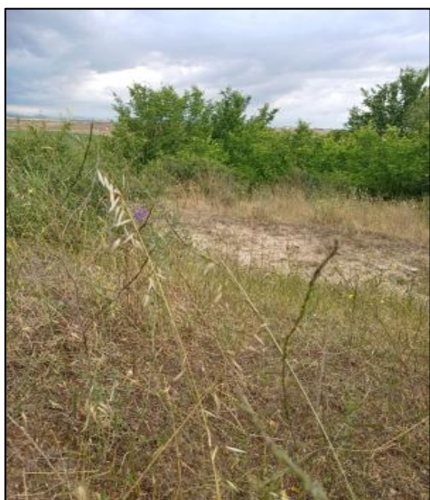
Fig. 3. A. clauda - Suspicious o. (Fuzuli district, Alkhanly village, 20.05.2024)