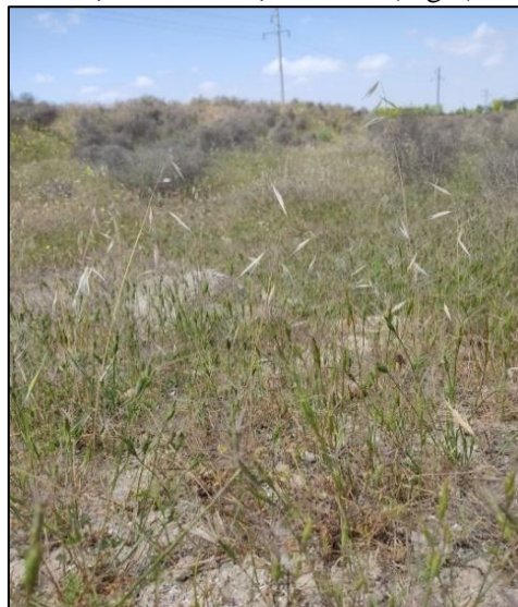
Fig. 5. A.ventricosa – Blistered o. (Khazar district, Zira village, 06.05.2023)

roadside, N40°21'38", E50°16'33", H-14 m; Pirallahi distr., seaside, N40°27'16", E50°20'05", H-9m; Pirallahi distr., Chilov island, fieldside, N40°19'16", E50°36'10", H-43 m. (Fig.5).