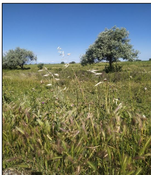
Fig. 6. A. sterilis subsp. ludoviciana - Ludovic o. (Beylagan district, Allahyarli village. 15.05.2022)