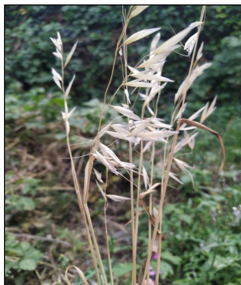
Fig. 2. A.eriantha -Soft-flowered oat. (Barda district, Yeni Dashkend village, 17.05.2023).