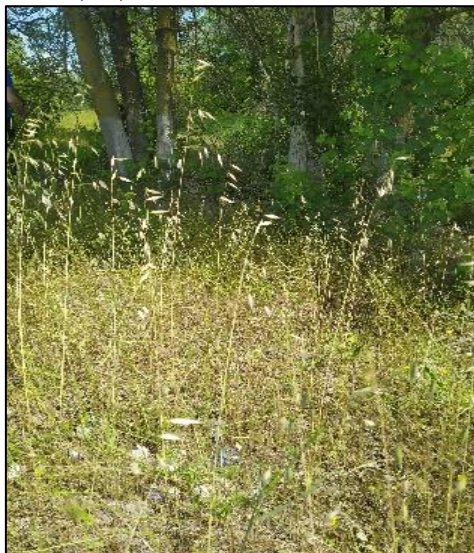
Fig. 4. A.barbata – Slender wild o. (Agjabadi district, Khojavand village, 16.05.2023).