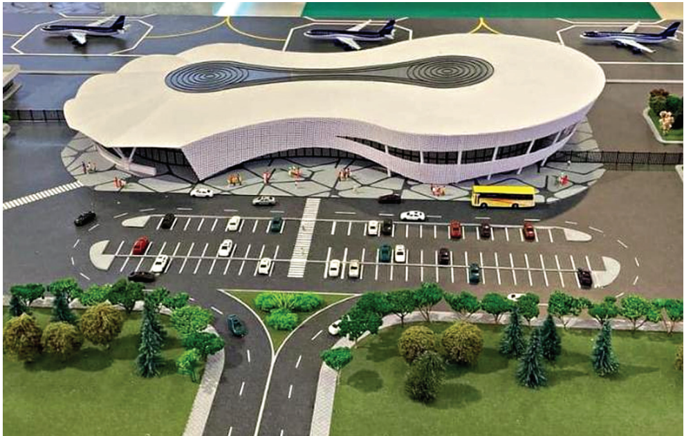
Fig. 11. Zangilan airport