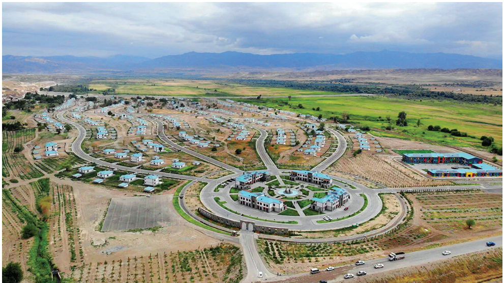
Fig. 10. Real construction of the village of Aghali