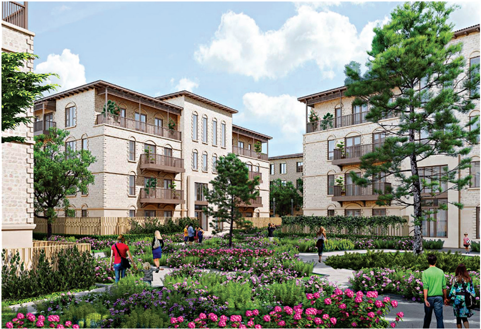
Fig. 3, 4. Residential buildings in Shusha will be like this.