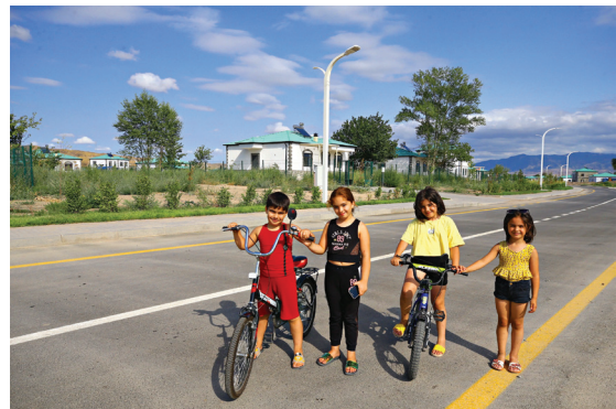
Fig. 12, 13. Zangilan residents