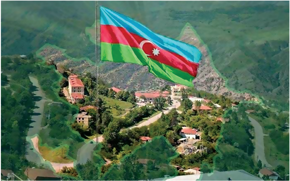
Fig. 1. Victory Road.