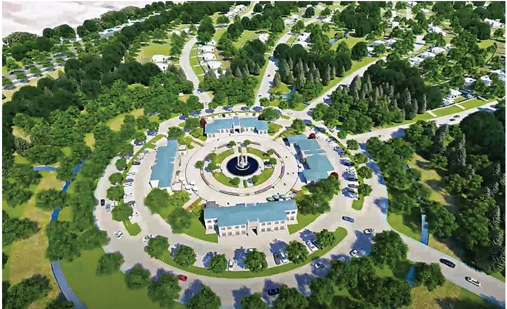
Fig. 9. The project for the village of Aghali