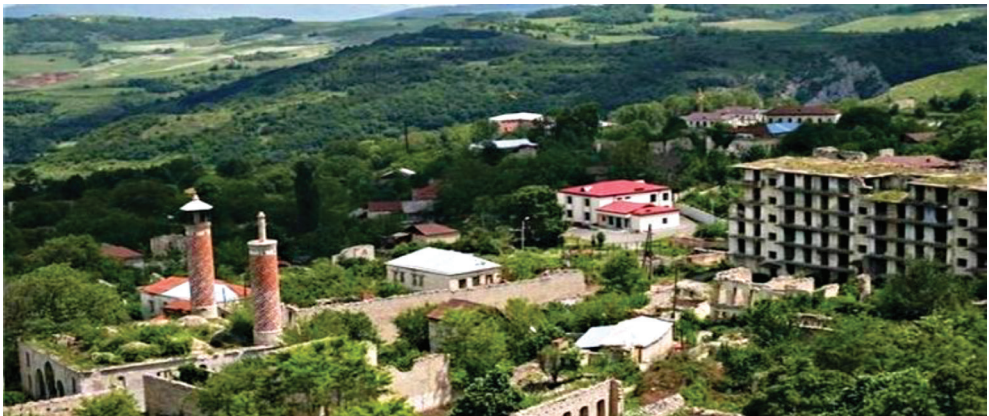
Fig. 2. Shusha after the occupation.