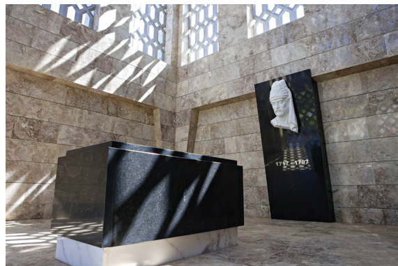
Fig. 7, 8. Mausoleum of the poet and statesman MollaPanahVagif. After restoration.