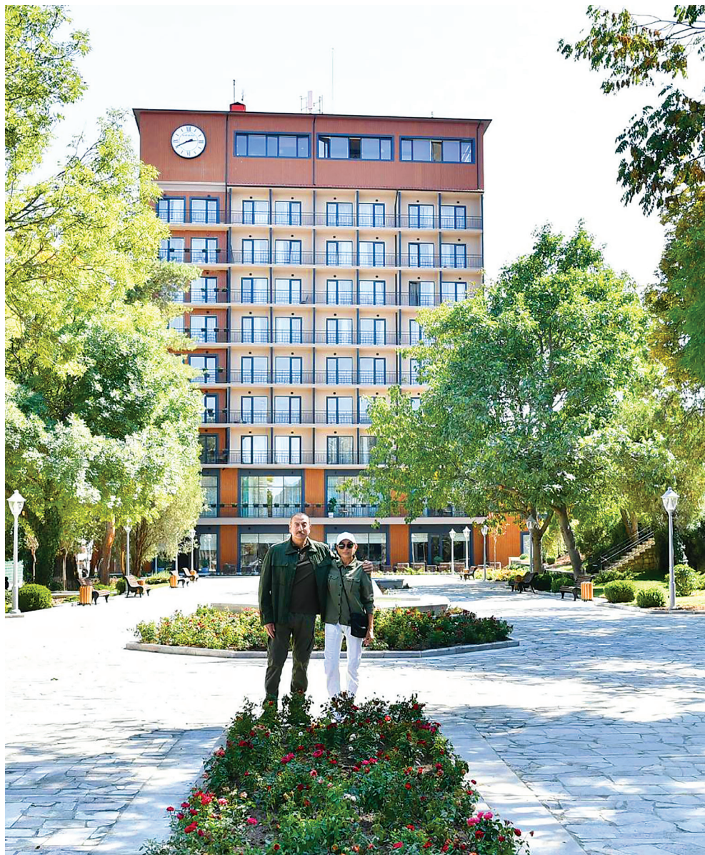
Fig. 5. President IlhamAliyev and First lady MehribanAliyeva at the opening ceremony of “Karabakh” hotel in Shusha.