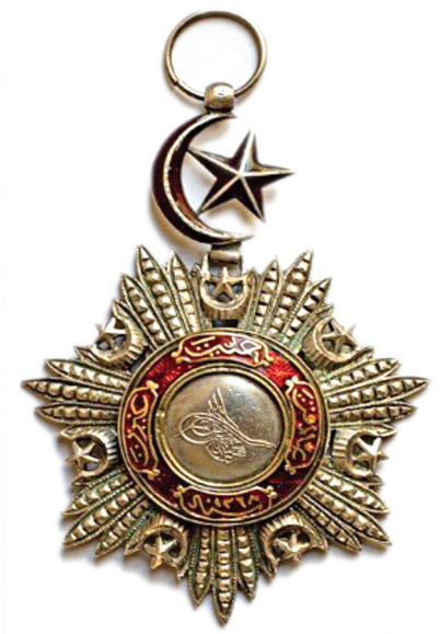
Fig. 3. The fourth grade “Majidiyye” order.