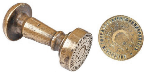
Fig. 2. The first stamp of Baku State University.