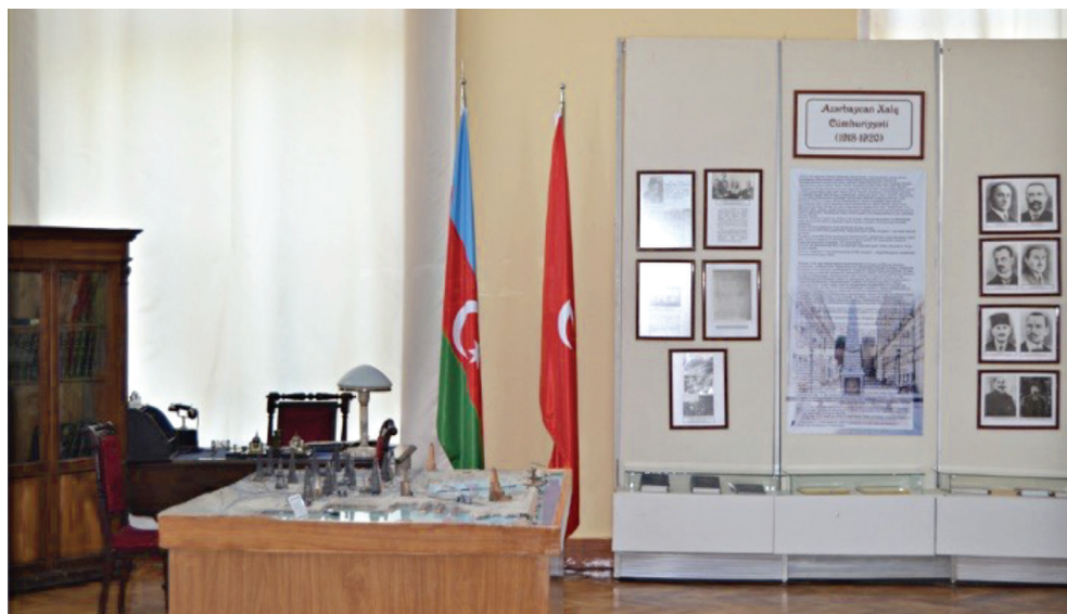
Fig. 5. The Museum of Independence (İstiqlal).

In 2016, the museum's collection was enriched with valuable materials: Feizavayar Khanum Alpsar Turan, residing in Istanbul, donated personal