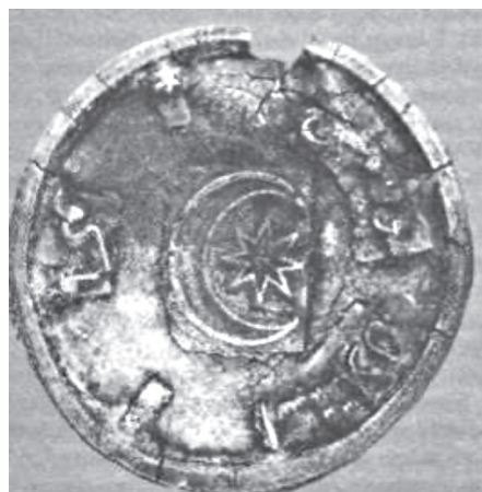
Fig. 4. The stamp the Museum of Independence.

Decades later, on January 9, 1991, the Museum of Independence was re-established as the spiritual successor to the original museum. Currently, the