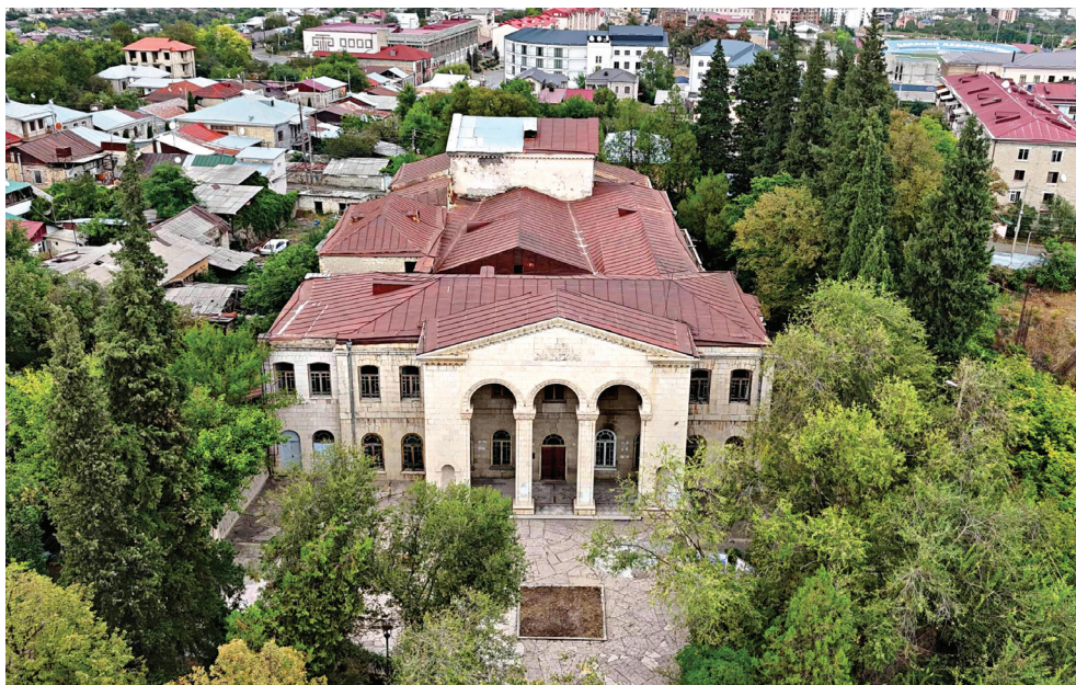
Fig. 7. General view of the Khankendi Theater

The Khankendi State Drama Theater, whose construction began in 1926, was completed on August 11, 1932. In the initial version, from that moment