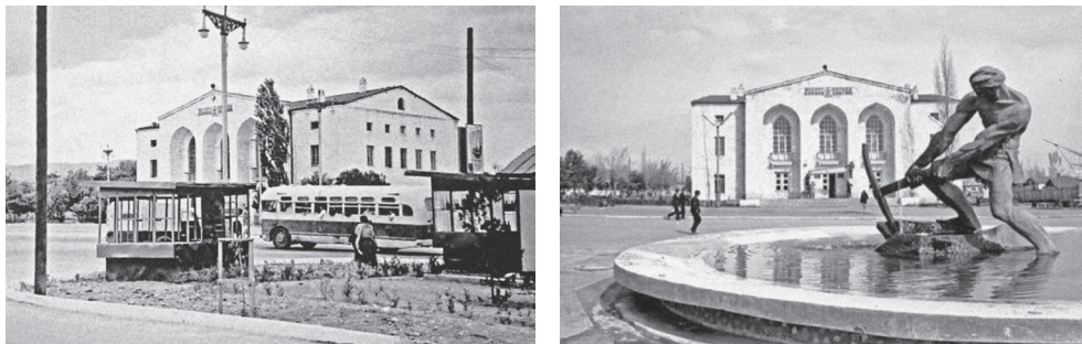
Fig. 2. General view of the Aghdam Drama Theater before the destruction

plays, as well as works written on historical and contemporary themes. The 1970s-1980s in particular are remembered as the most productive and famous years for the Aghdam State Drama Theater (Fig. 2).