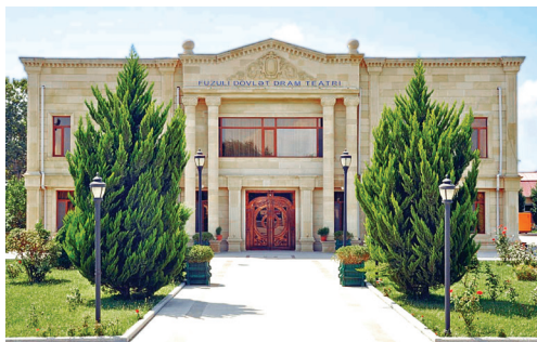
Fig. 6. View of the Fuzuli State Drama Theater

According to the order No. 89 of the Minister of Culture and Tourism of Azerbaijan dated February 20, 2015, the Horadiz Palace of Culture, together with its property, was transferred to the balance of the Fuzuli State Drama Theater. Today, the theater operates in the Horadiz City Palace of Culture, which has undergone major renovation (Fig. 6).