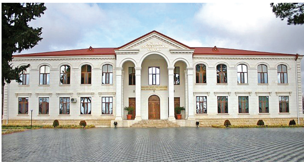
Fig. 5. A. Hagverdiev Aghdam State Drama Theater in the village of Guzanli

After the occupation of Aghdam, the theater continued its activities, although it was located in an unsuitable building for some time. In 2011, the Culture House in the village of Guzanly was thoroughly renovated and put into operation as the building of the Aghdam State Theater (Fig. 5).