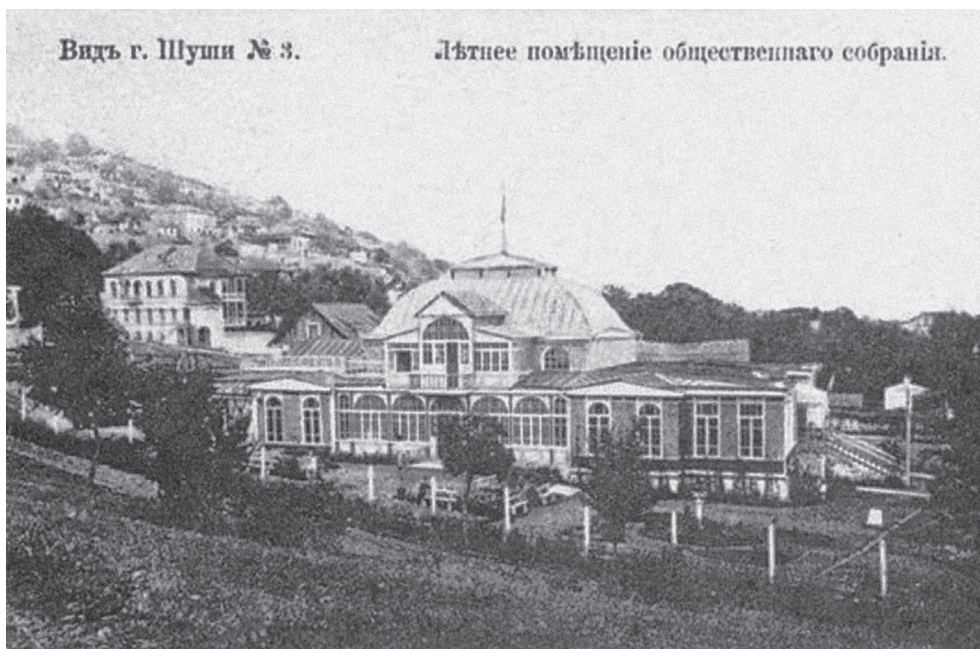
Fig. 1. General view of the summer public meeting (assembly) building

During the World War, the Shusha State Musical Drama Theater named after Uzeyir Hajibeyli was established (1943). The theater, which has its own rich tradition, did not stop its creative activity despite the difficulties it faced [4].