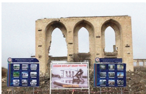
Fig. 4. View of the destroyed Aghdam Drama Theater

the Aghdam State Drama Theater (Fig. 4).