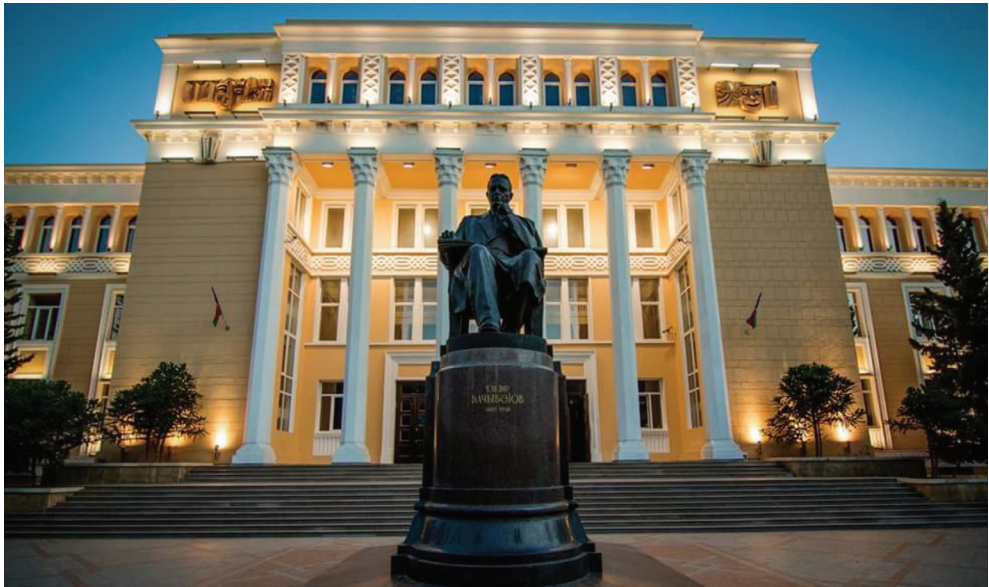
Fig. 2. Azerbaijan State Conservatory” named after U.Hajibeyov.