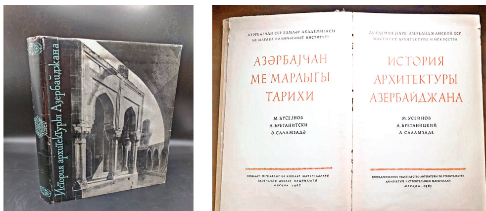
Fig. 5. The book “Architecture History of Azerbaijan”