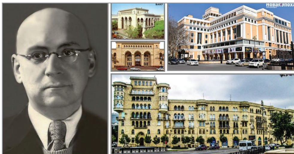
Fig. 1. Academician Mikayil Useynov.

Dwelling and public buildings built in the classical architectural style occupy a special place among the works designed by M.Useynov, one of the most prominent figures of the Azerbaijani school of architecture. The architect, who turned classical architecture into his creative credo and motto, succeeded in creating architectural examples of high artistic value that are unparalleled in our national architecture.