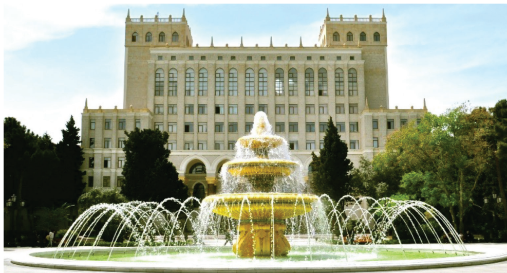
Fig. 4. The building of ANAS.

The use of symmetrical composition occupied a special place in the architect's work. His symmetrically designed projects include two 10-story dwelling buildings, 16-story houses (1970s) next to the Government House, the 16-story Azerbaijan Hotel (1969) on the western side of the Freedom Square and the Absheron Hotel (1985) on the eastern side; the "Nizami" cinema center, an example of the Greek and national architectural style, and its symmetrical counterpart buildings. The construction of the Freedom Square ensemble in Baku occupied a significant place in Useynov's creative career in the 60s–80s. The architect's work was highly appreciated and he was awarded the State Prize. Hotel projects occupied a special place in Academician M. Useynov's creative career. The architect was commissioned to design the Moscow Hotel in the Baku amphitheater, on H. Javid Avenue in 1970, and the master accomplished masterfully with this task. The construction of the hotel, which blends harmoniously into the landscape, began in late 1977. The architect applied the neoclassical and romantic approach he used during the construction of the "Absheron" and "Azerbaijan" hotels to the construction of the Moscow Hotel. The hotel was put into operation in 1980, with a total area of 15,233 square meters.