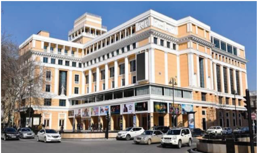
Fig. 3. The “Nizami” cinema center.