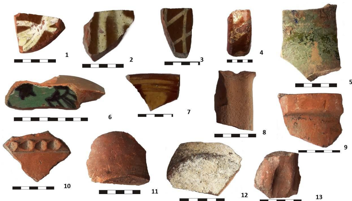
Figure 5. Enikh. Ceramic product. Scale varies.

One of the exemplary pieces is a glazed pottery vessel. Its clay is brown in color. Its composition is pure (Fig. 5) [2, s. 7-12]. This piece has a different feature from the others. On one side of the pottery vessel fragment, the remains of a pattern drawn with white-yellowish glaze are observed, but the background of this pattern consists of the natural color of the pottery and is not covered with transparent glaze. On the other side, brown glaze was first drawn, and a pattern was depicted on it with yellow-whitish glaze. As can be seen, the pattern is drawn as a decoration resembling a net consisting of rhombic elements. After all the work was completed, this surface of the vessel was covered with transparent glaze (Fig. 5: 3). The wall thickness is 0.5-0.6 cm, the width of the pattern line is 0.2 cm, and the length of one side of the rhombus is 1.5 cm [2, s. 7-12].