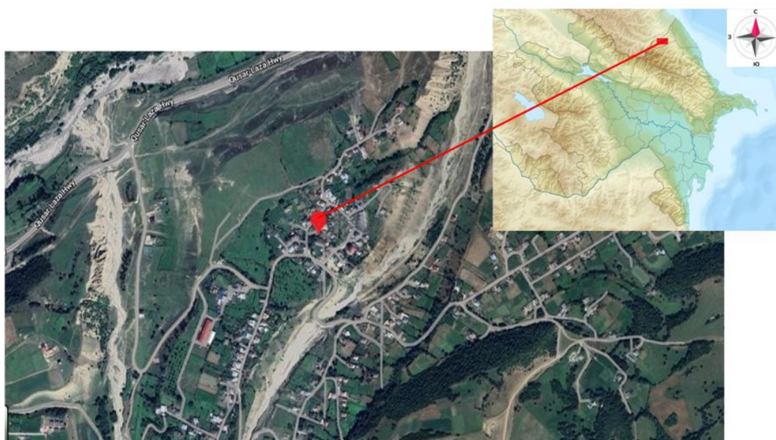
Figure 1. Image of Anig village on the map of Azerbaijan in Google Earth program

Shahdag Olympic Sports Complex road, at an altitude of 1100 m above sea level (Fig. 1). Geographical coordinates of Anig ( Enykh ): 41° 34' 68.26" N - 48° 22' 51.76" E [2, s. 1; 3, s.43-44].