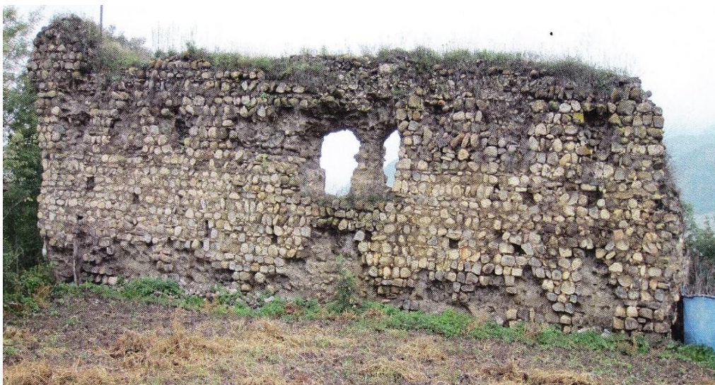
Figure 2. General view of the Anig (Enykh) fortress.

I would like to note that the archaeologist J.Khalilov localized the Abkhazian city mentioned in written sources, but not confirmed from an archaeological viewpoint, in the Enykh fortress [1, s. 96].