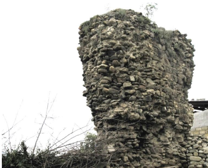
Figure 3. Images of a small fragment of the Anig (Enykh) fortress.

Among the ceramic samples discovered in the excavation site, the discovery of a copy from the early Middle Ages (inv. No. 21, photo 65) leads to the formation of new ideas in the investigation of the history of Enykh fortress [2, s. 4-10]. Thus, the discovery of a grave monument from the early Middle Ages during the research conducted around the fortress, also gives reason to come to such a conclusion. However, the fact that the foundation of the relevant period has not been uncovered yet it does not give us reason to make a definite opinion about it. That piece of pottery can also testify to the revival of life at the fortress site since the early Middle Ages [3, s. 43-44]. The date of the destruction of the Enykh fortress is very precisely determined based on the comparative analysis of the Georgian chronicle of the 14th century and Fazlullah Rashiduddin's work "Jāmi' al-Tawārīkh ('Compendium of Chronicles', also "Universal History")" (completed in 1310/11). It was known that this event took place in May 1288 [2, s. 93-95].